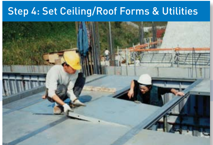
Step 4: Set Ceiling/Roof Forms & Utilities