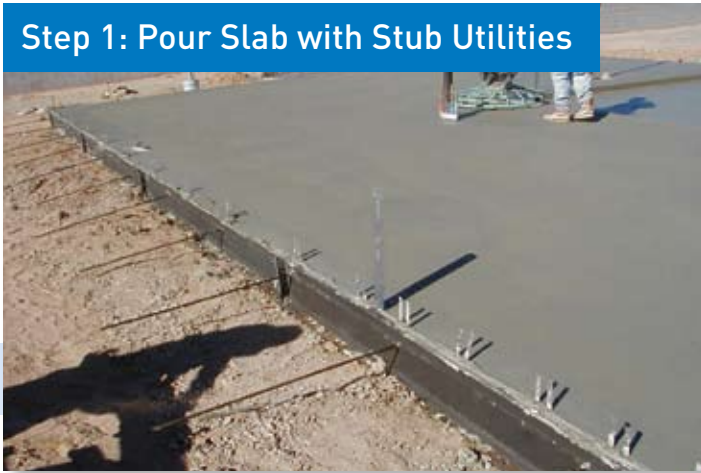
Step 1: Pour Slab with Stub Utilities