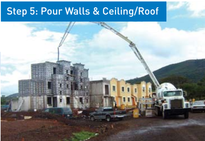
Step 5: Pour Walls & Ceiling/Roof