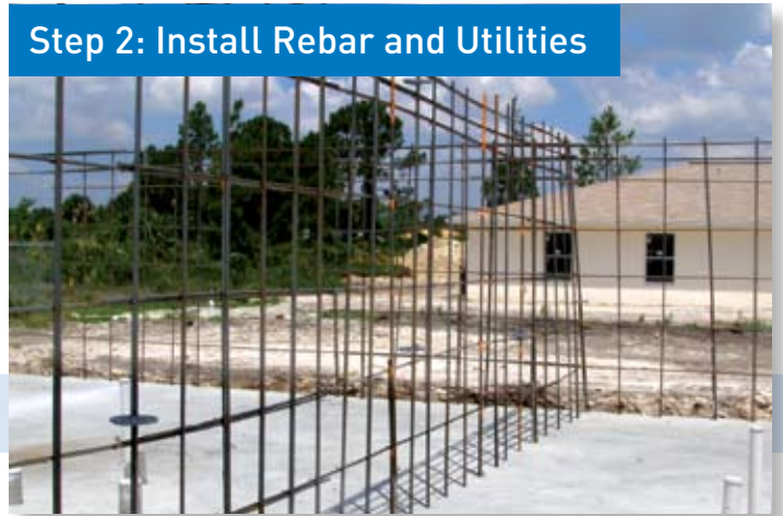
Step 2: Install Rebar and Utilities