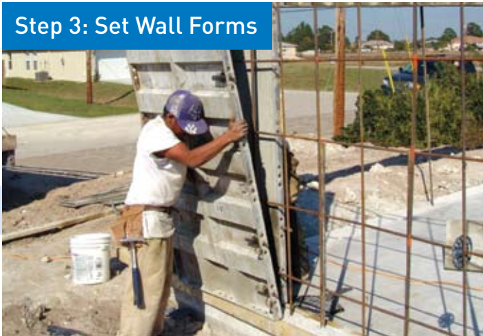
Step 3: Set Wall Forms