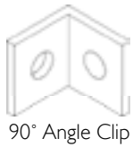
90° Angle Clip

2"x2" OSC Angle or 90° Angle Clip at each hole. (Not for use in column applications.)