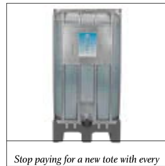
Stop paying for a new tote with every empty.

To get started with this unique program, contact your local Western Forms representative or call 800-821-3870 today!